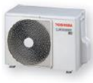
Outdoor Unit NTS-NAR502D5