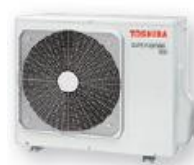
Outdoor Unit NTS-NAR632D5