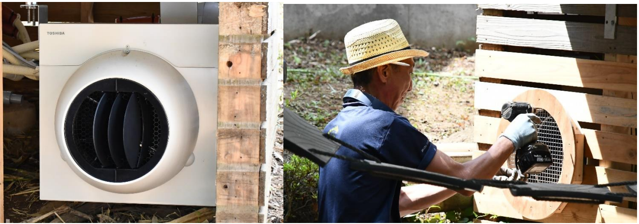
Installation of the FLEXAIR at Chiba Zoological Park.